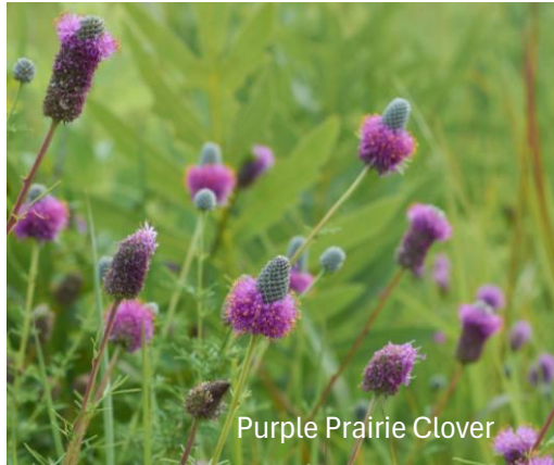
Purple Prairie Clover