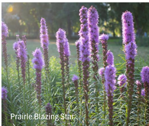
Prairie Blazing Star