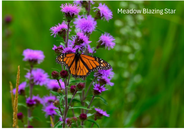
Meadow Blazing Star